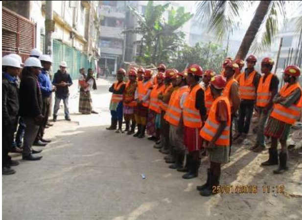
Contractors providing Training to the Women Labours