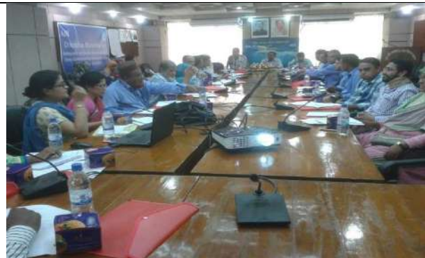
Gender Orientation Workshop