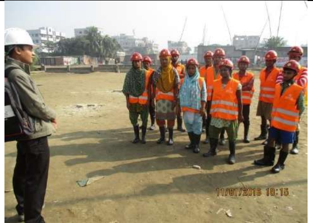
Contractors providing Training to the Women Labours