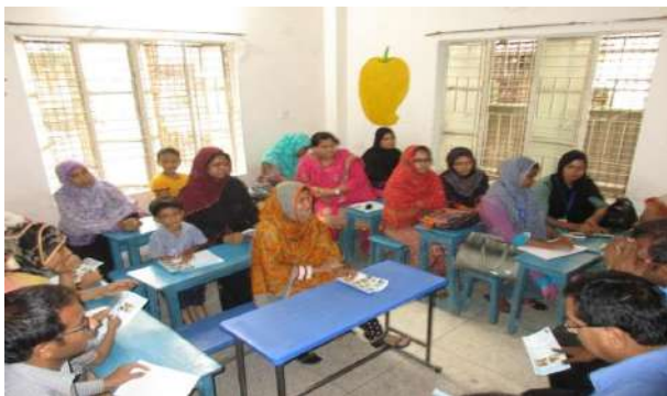
Project information Disclosure Meeting